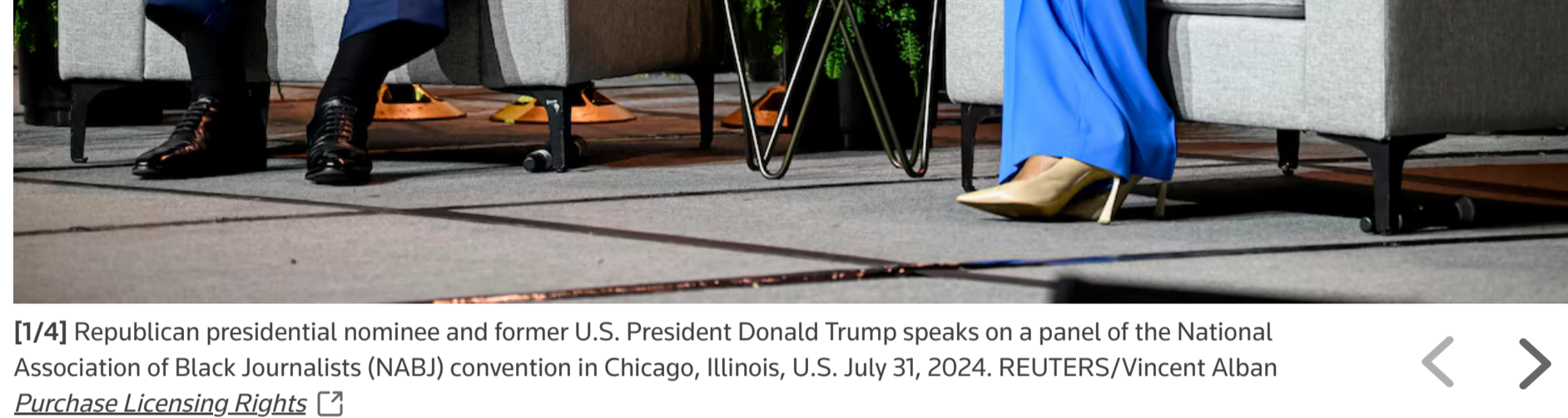
[4] Republican presidential nominee and former U.S. President Donald Trump speaks on a panel of the National Association of Black Journalists (NABJ) convention in Chicago, Illinois, U.S., July 31, 2024.

Trump also declined to say whether Harris was a "DEI hire," as some fellow Republicans have claimed, saying, "I don't know."